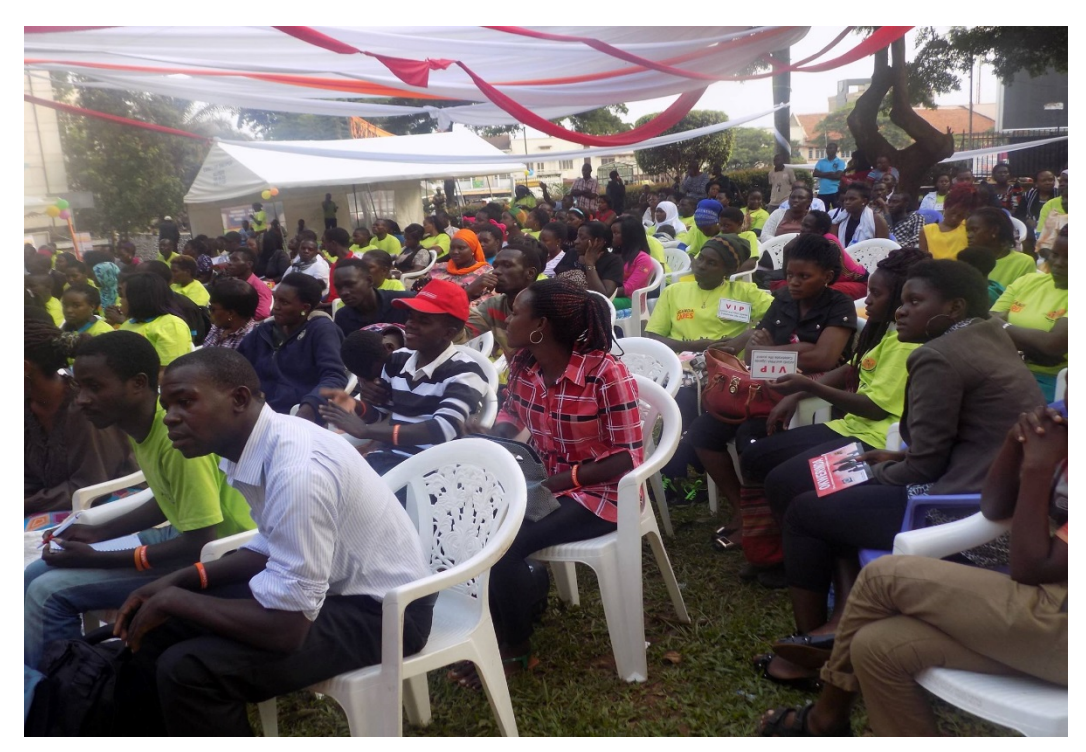
Why do we want an HIV cure in Africa?

Burden, Mortality, Cost and dependency, Stigma, Toxicity, options, death 340000 Africans died UNAIDS